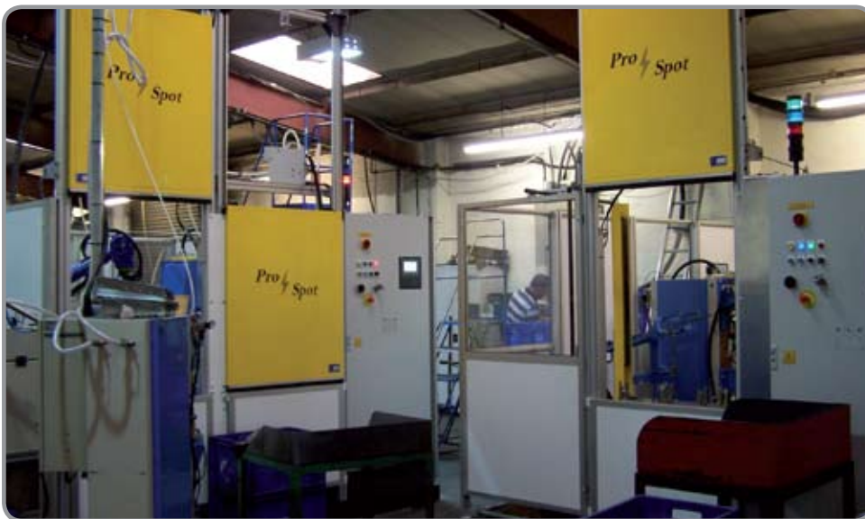
Robot welding cells for BMW mini Airbag covers

Prospot has the capability to design and manufacture robot welding systems for all types of welding applications either using new equipment, refurbished equipment or utilise our customer's own redundant machines to make cost effective solutions.