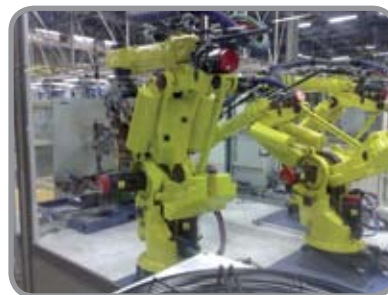
Triple robot cell for welding rear quarter bodyside assemblies