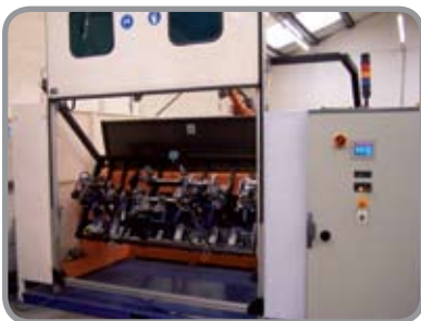
Mig welding robot cell with orbital turntable for welding facia assemblies