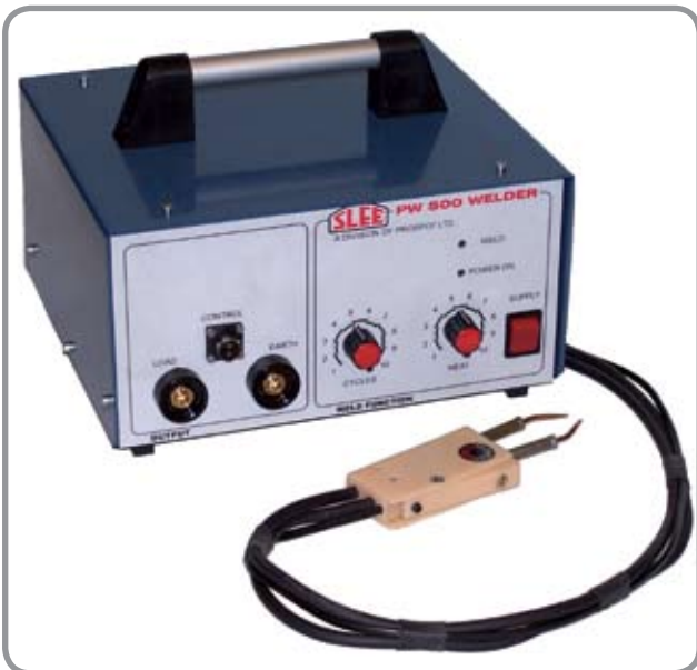
PW 500 POWER UNIT

The PW 500 power unit houses a 500VA welding transformer, solid state synchronous timer with phase shift heat control contained in a steel casing.