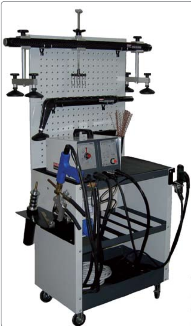
Example of COMBI CAR system with CAR 3 trolley and PA rear perforated panel to hold SYSTEM 50 and SYSTEM 100.