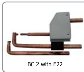
BC 2 with E22