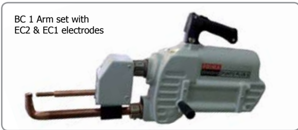
BC 1 Arm set with EC2 & EC1 electrodes